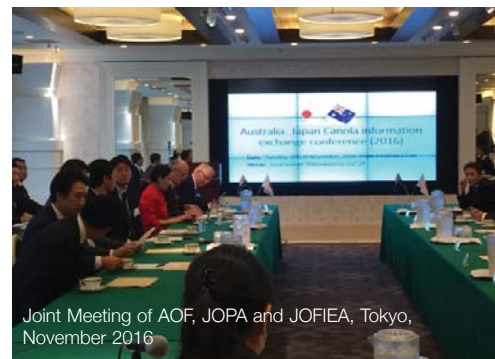
Joint Meeting of AOF, JOPA and JOFIEA, Tokyo, November 2016