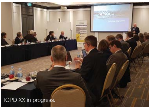
IOPD XX in progress.

Delegates then headed to Parkes, Forbes, and Orange in the NSW Central West for two days, where they visited several farms, the MSM oilseed processing facility, and other sights of interest.