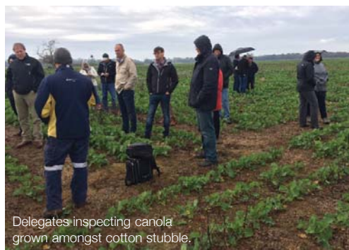
Delegates inspecting canola grown amongst cotton stubble.