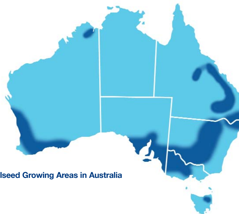
Oilseed Growing Areas in Australia