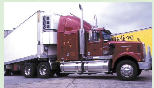
Trucks then deliver the spreads to the supermarket