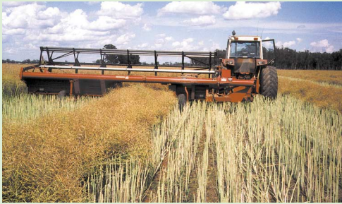
The oilseeds are harvested.

These Australian plants produce seeds called oilseeds.