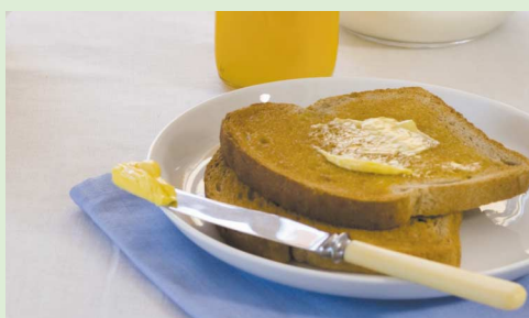
to be enjoyed by you!