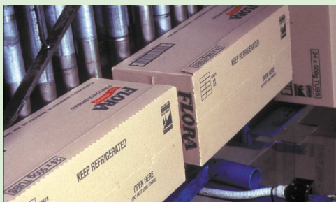
and packed into cartons.