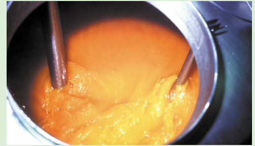
The oils are refined, cleaned and mixed.