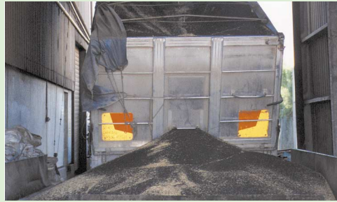
Trucks deliver the seeds to a crushing mill.