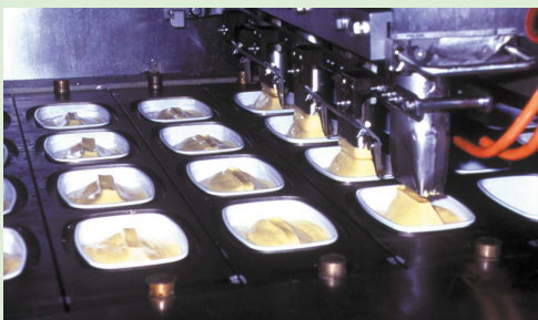
Once chilled, the spread goes into the tubs